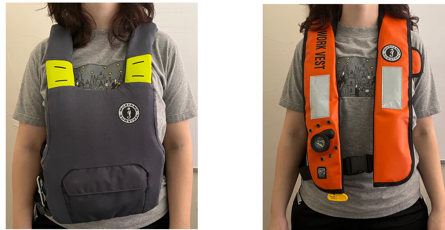
Figure 2. Traditional dual PFD (left) and an automatic minimalist PFD (right)