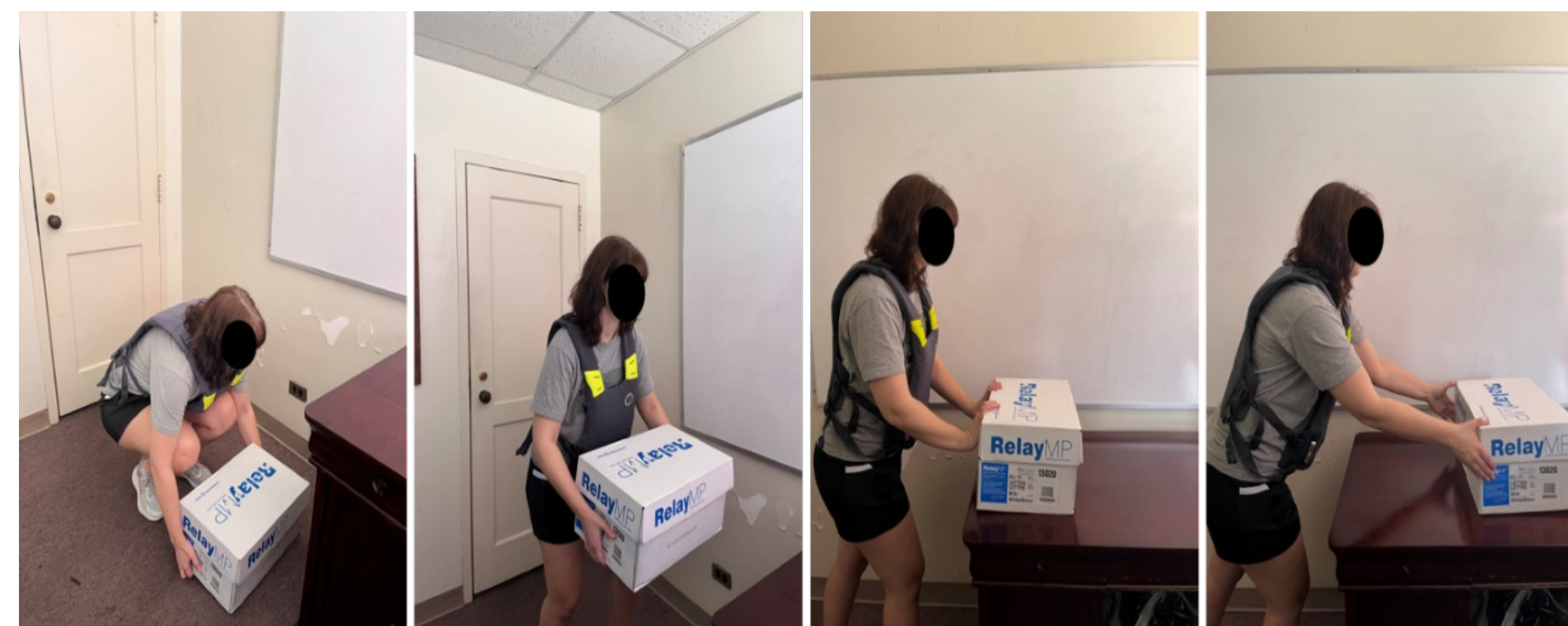
Figure 3. Participant performing the physical workload task of repeated lifting and placing the weighted box wearing the traditional dual PFD