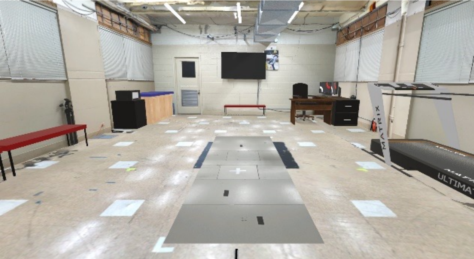
Figure 1. Experimental procedures od slip and trip gait training in RGT (top) and VEGT (bottom).